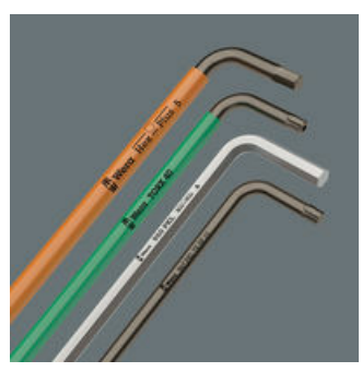
The size of each L-keys has been engraved by a laser. In addition Take it easy L-keys have a colour coding according to sizes - for simple and rapid accessing of the required tool. Making it easy to find the right tool.