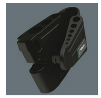
The wear-resistant clip material ensures that the L-keys are securely held yet are easy to remove.