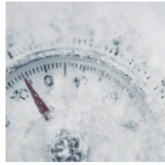
The stainless steel tools from Wera are vacuum ice-hardened and have the hardness and strength needed for screw connections. There are no limitations to the industrial applications they are suitable for.