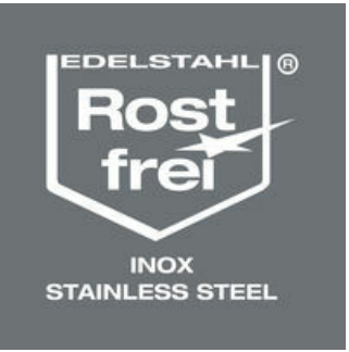
Stainless L-keys are hardened to the same strength as conventional (carbon) steel tools, and prevent extraenous rust forming.